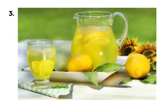
TYPE YOUR ANSWER