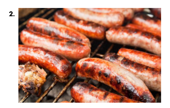
TYPE YOUR ANSWER