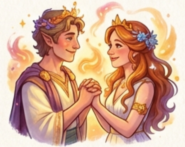
Oberon an Titania